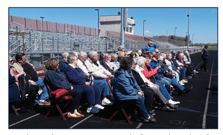
Watching a drone presentation on the "Come Fly With Me" Mystery Day Trip.