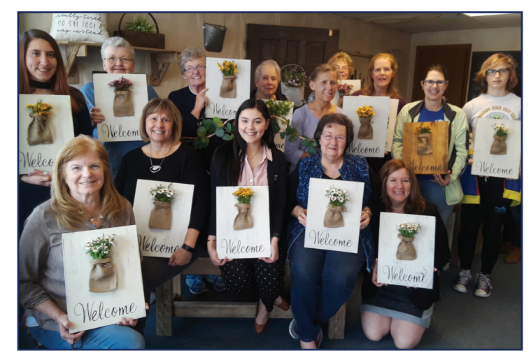
Platinum Adventures members enjoyed making a spring welcome sign.